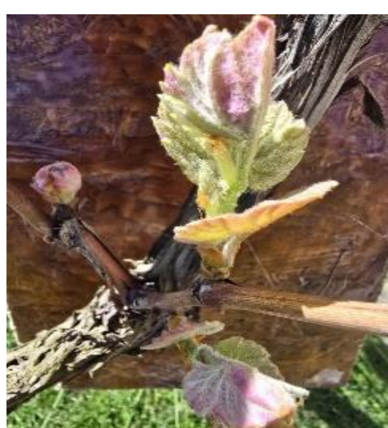
Fig. 1 Biological material used Vitis vinifera L.-original